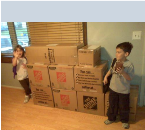
Boxes ready to be shipped to military families nationwide!